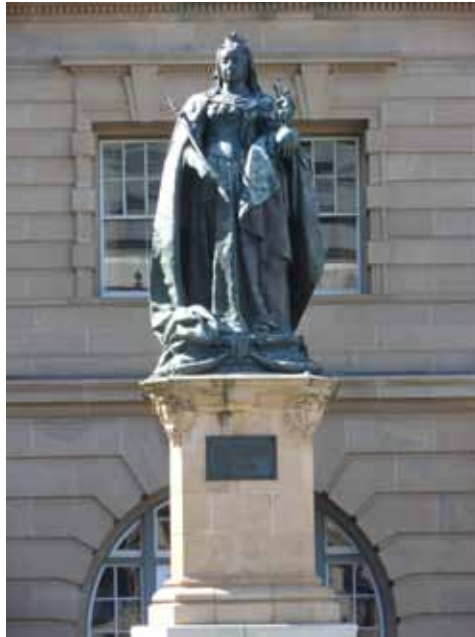
Statue of Queen Victoria in Queens Gardens, Brisbane.

Brisbane River is a meandering stream, and Brisbane (city) is sited on a bend with roads laid out in the standard grid pattern. Since the area was constrained between the