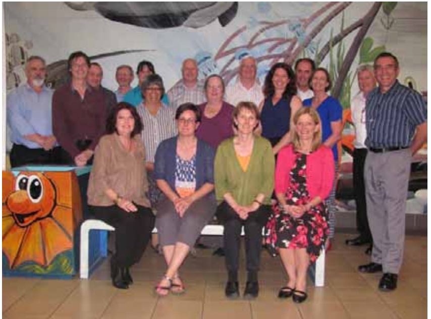
CGNA delegates pose in Townsville, surrounded by distinctive Reef Aquarium decorative art

In one of the final agenda items of the conference, the Committee agreed to a name change rather more central than usual—it recognised that its own name was rather cumbersome and styled differently from those of comparable committees. CGNA will recommend to ICSM that it become the Permanent Committee on Place Names.