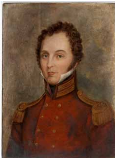
Governor Richard Bourke

1849. Grant and Normanby were included in the list, so they may be taken as confirmed at this date. The counties (in the order of the proclamation, roughly from west to east) were Follett, Dundas, Normanby, Villiers, Ripon, Hampden, Heytesbury, Polwarth, Grenville, Grant, Talbot, Dalhousie, Anglesey, Evelyn and Mornington. In addition, seven proposed counties in Gippsland (Douro, Bass, Haddington, Bruce, Abinger, Combermere and Howe) were listed in the newspaper report. These 'ghost counties' appeared on a map dated 1852 but were apparently never proclaimed. 4