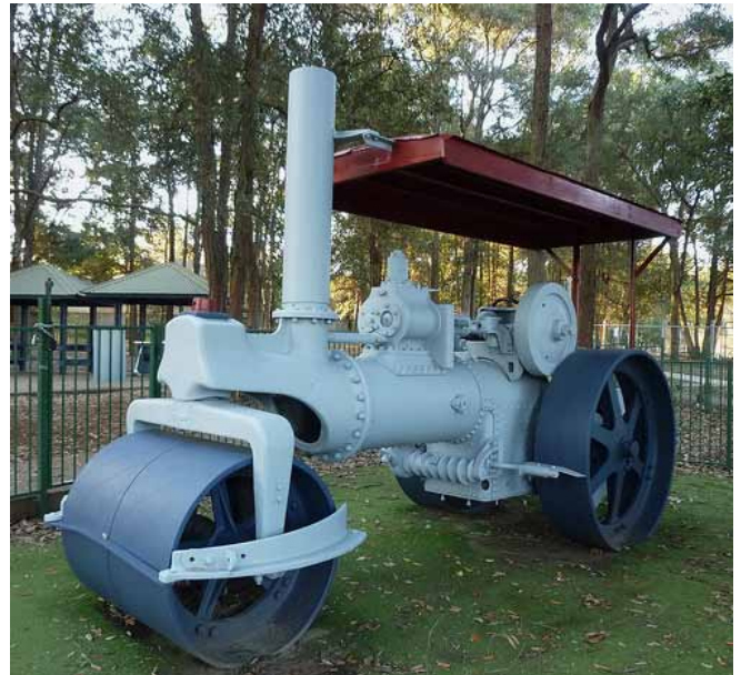
The 'Steamroller Park' at North Epping Oval

Naturally, there are many more steamroller parks to be found around Australia. They include the Steamroller Park in the Adelaide Hills, the reserve officially known as Glebe Park in Bowral, and the steamroller park in Toowoomba officially known as Queens Park . We would be very interested in finding out about more steamroller parks in Australia. Please send us any information you may have on them. In fact, we are interested in