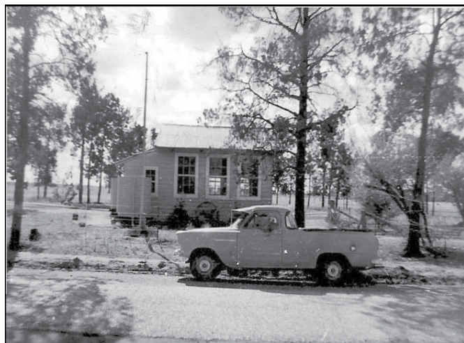
Coads Tank School, c. November 1963