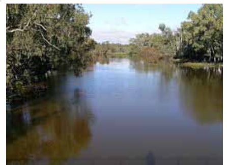
The Bogan River at Nyngan

How, you ask? By building a 'big bogan' statue. Says the mayor, 'it'd be a bloke wearing shorts and a singlet with a fishing rod and a tuckerbox, which people could sit on and take photographs.' The cost would be about $8000—cheap at the price, we say!