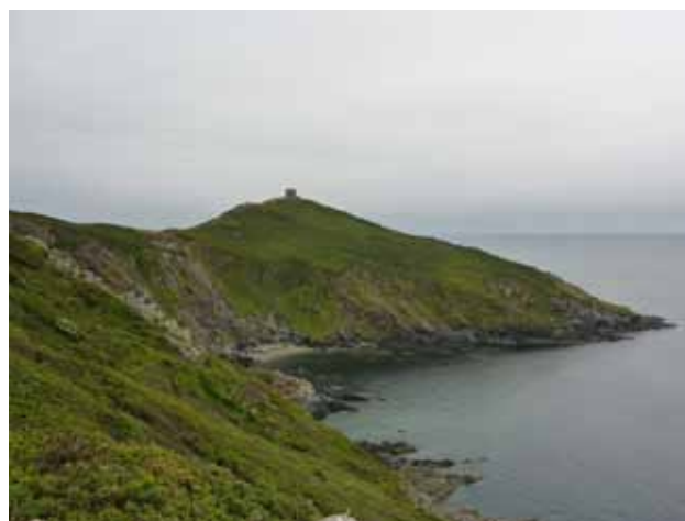
Rame Head, Cornwall.

On that day he passed Ram Head, Cornwall (now spelt Rame Head ), and to mark the anniversary the Restoring Cook's Legacy 2020 team is organising a weekend event on 25/26 August at Mallacoota, Victoria. This will include a talk, 'Lt James Cook on the coast of Victoria 1770—a comedy of errors', and a walk to Little Rame Head. All are invited and would be warmly welcomed: email restoringcookslegacy2020@gmail.com for details.