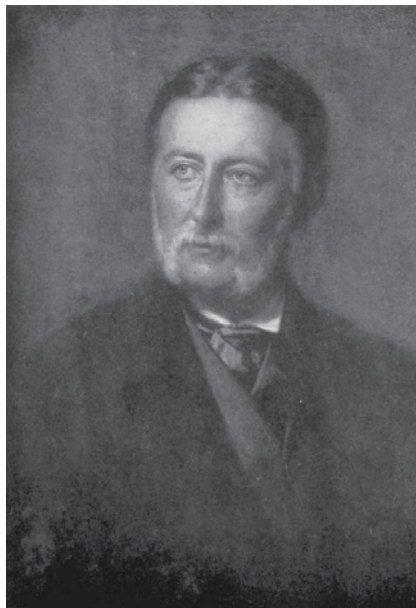
W. J. Evelyn MP - portrait by Havell (1884)

The Post Office had opened in 1904 under the name Valinda . After the station became Evelyn , the Post Office name also was changed to Evelyn , on 10 April 1908. The Post Office added the prefix 'Mount' to the name on 26 September 1913. 14 The station was renamed Mount Evelyn in April/May 1919.