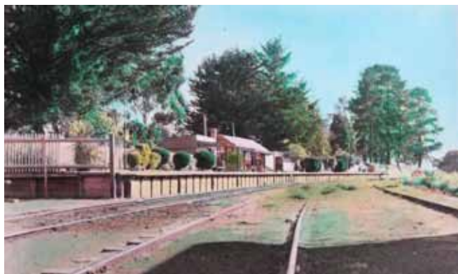
Mount Evelyn station

Mount Evelyn is 37km east of Melbourne in the local government area of Yarra Ranges. Various described as a 'locality', a 'township' or 'a suburb of Melbourne', it developed around the highest railway station on the Lilydale to Warburton line. The station name was changed twice, from Olinda Vale , to Evelyn , to Mount Evelyn . To trace the most probable explanation of the name, we need to start with the Evelyn family.