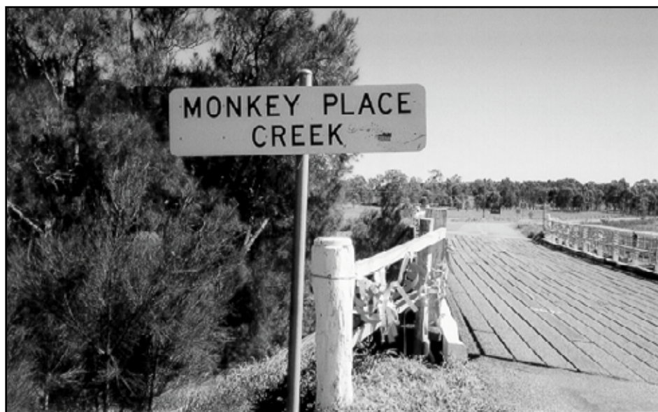
Monkey Creek Place NSW.