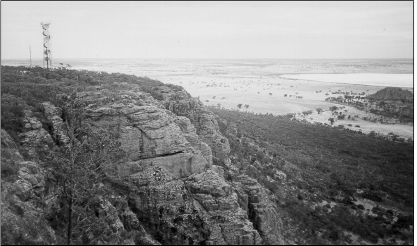
View from Mt Arapiles.