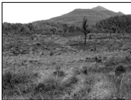
Adamsons Peak.

Castle Cary (named by Frankland after a place in Cornwall) is a very prominent granite knob north of Avoca that you see as you drive along the Esk Highway. While Bare Rock, further east along the highway, is referred to by locals as The Vertical Acre.