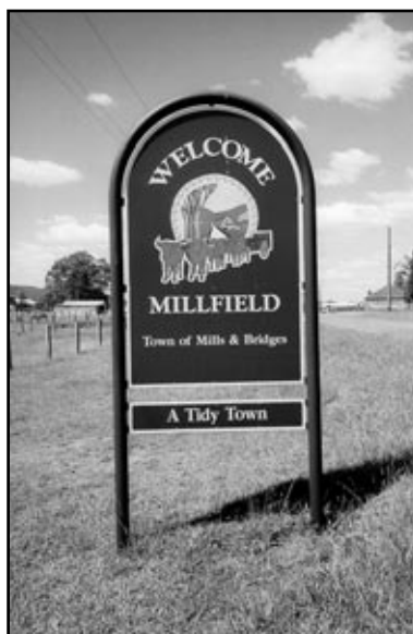
Millfield NSW.

Recently I was on holiday and came across a whole string of