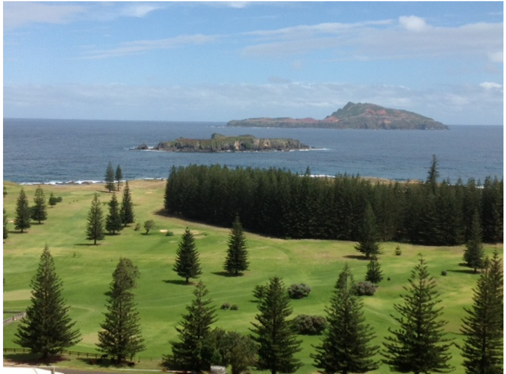
View from Queen Elizabeth Lookout, looking south across the Norfolk Island golf course to Phillip Island and Nepean Island

Lesley Brooker: 'WA Exploration 1836-1890' (in preparation)