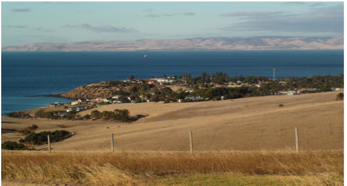
Penneshaw looking north-east towards mainland South Australia

Lesley Brooker: 'WA Exploration 1836-1890' (in preparation)