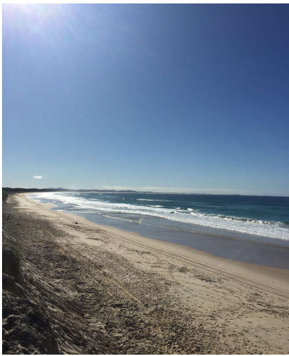
Bennetts Beach at Hawks Nest, SLSA223