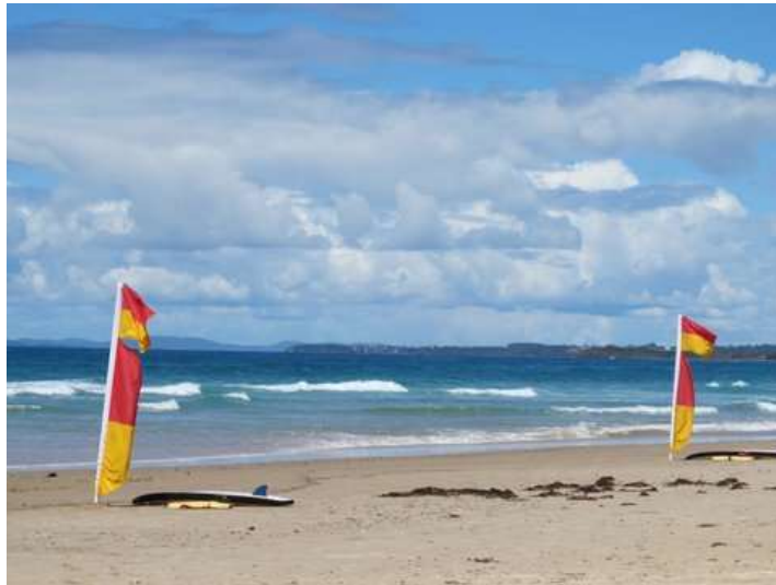
Old Bar Beach, SLSA187