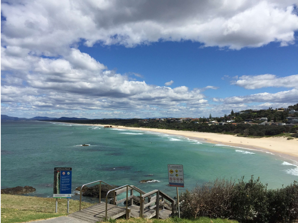
Lighthouse Beach at Port Macquarie, SLA172