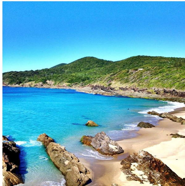
Burgess Beach, SLSA199

The general assumption for the entries is that the included generic is 'Beach'. The entry for Iluka therefore represents the toponym Iluka Beach . In cases where the authority omits the generic or uses another, the toponym appears in square brackets: [Pipers Hill], [Queens Head]. In some of these cases, it is not clear whether the beach name simply lacks a generic or whether the beach is, in fact, unnamed (and the listing merely implies 'the beach at Pipers Hill / Queens Head'). This problem does not arise with the GNB entries because, as noted above, the feature type always makes it clear whether the toponym is that for a BEACH or for an associated nearby feature.