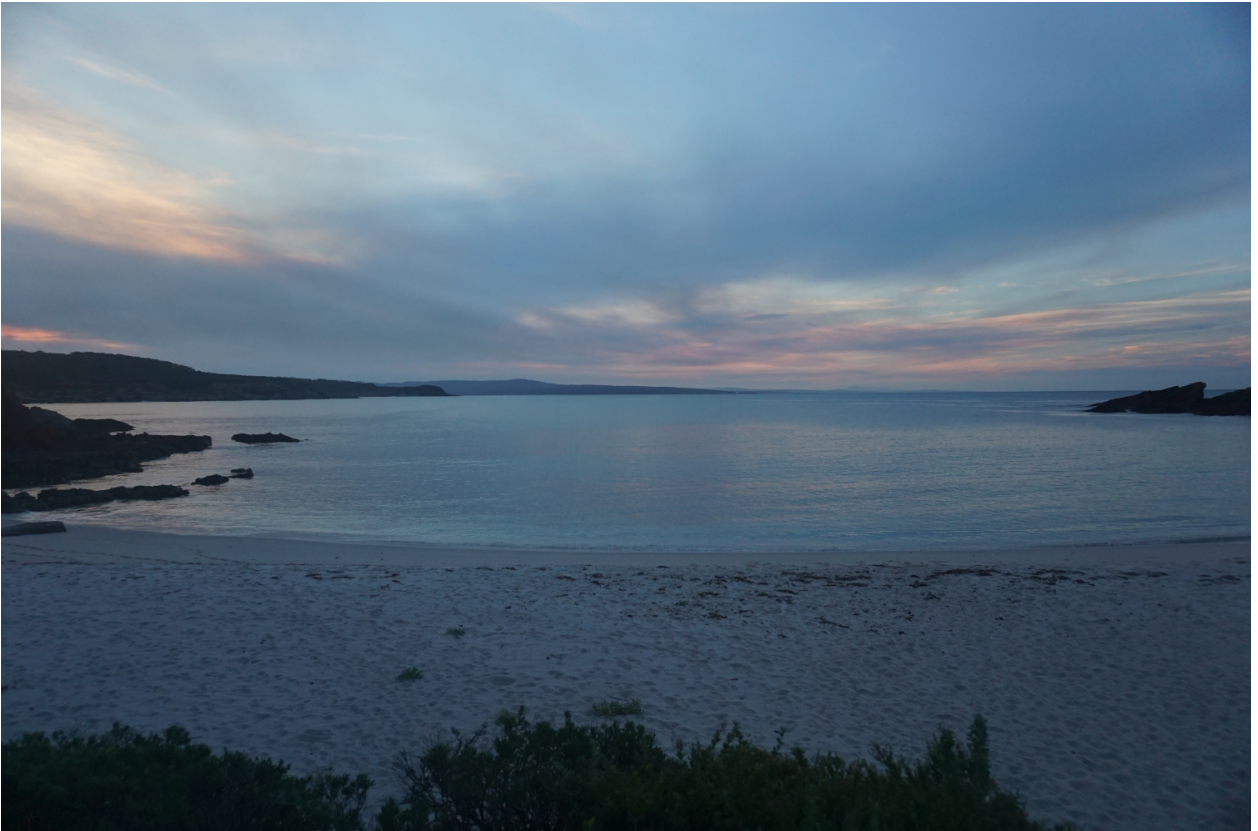
Unnamed beach east of Mowarry Point, SL5A706