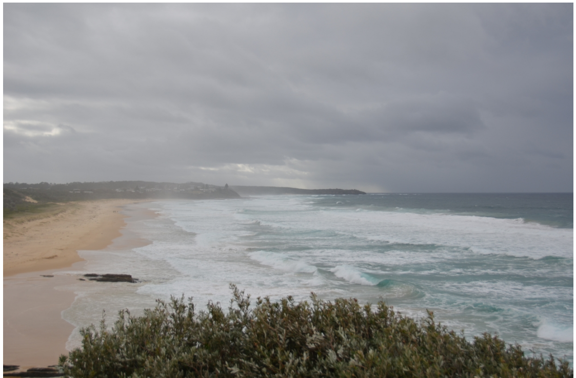
Racecourse Beach, SL5A475

2 Also cited in Australian Geographic March/April 2019, p.18. ‘...this 30m-wide cove... accessible via a short beachcombing stroll south from the better-known Pretty Beach and doesn’t have an official name but it’s known as Singing Stones Beach.’