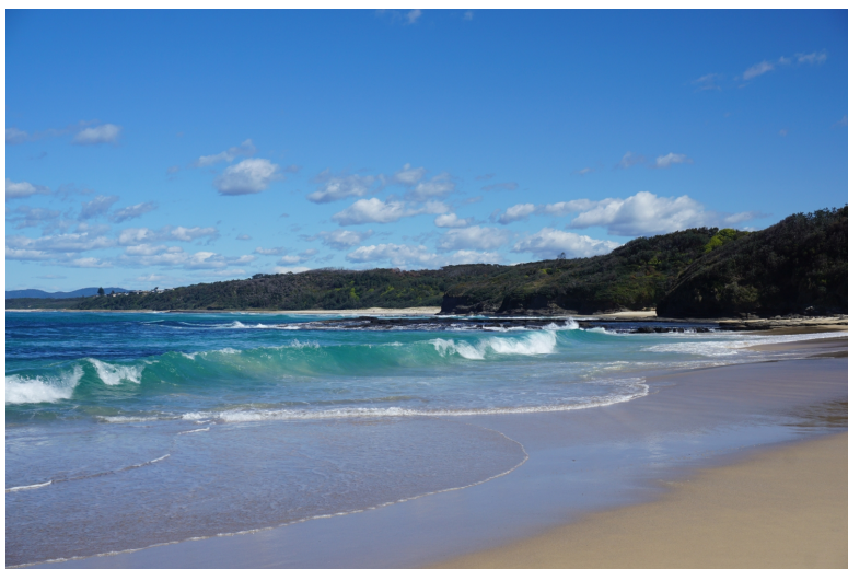
Rennies Beach, SLSA474