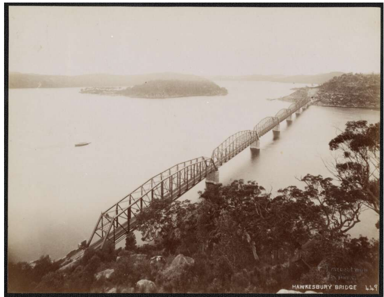
The original Hawkesbury River Railway Bridge at Brooklyn, N.S.W., ca. 1885

Published for the Australian National Placenames Survey This online edition: September 2019