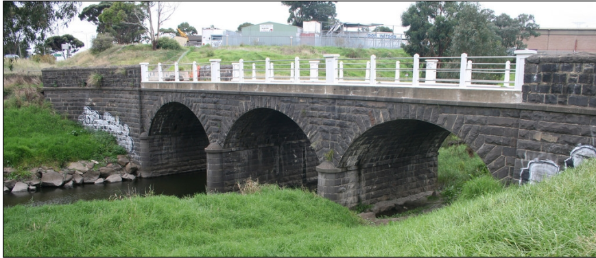
Figure 1 Melbourne's Brooklyn Bluestone Bridge