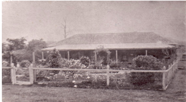
Huntingdon House – undated