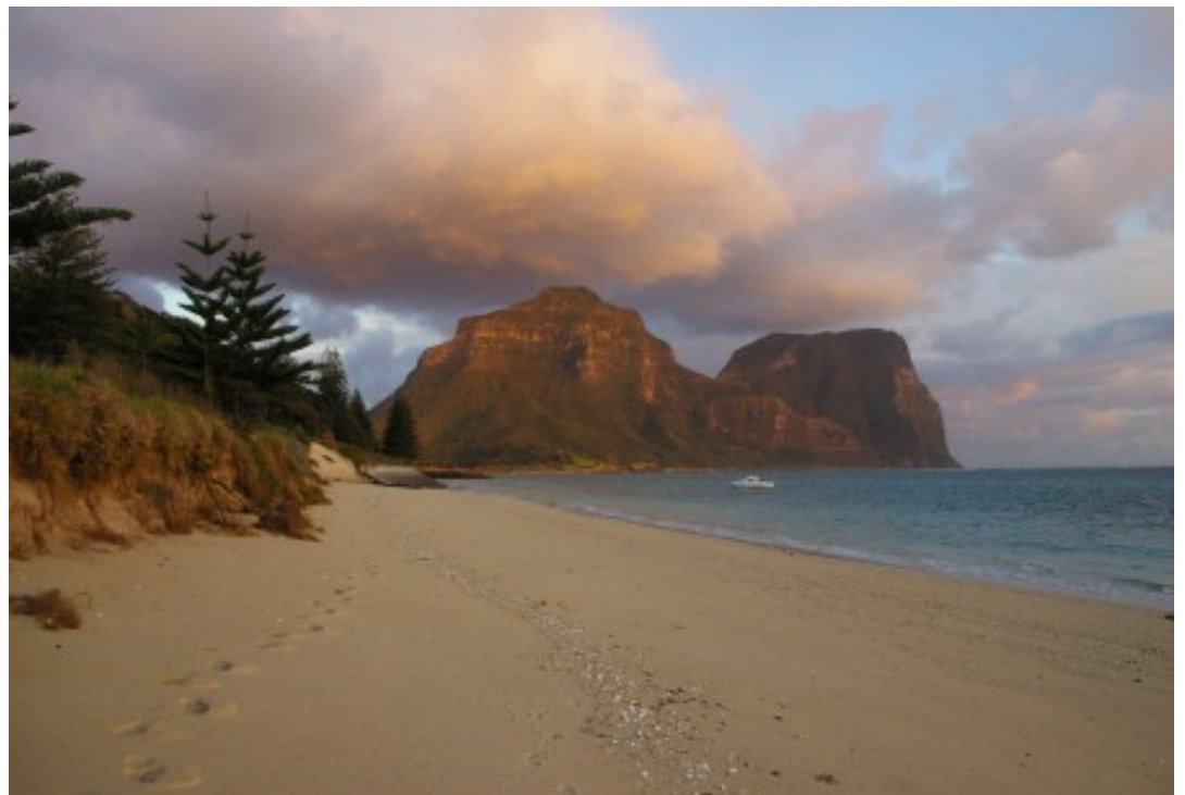
Mounts Lidgbird (left) and Gower, from Lagoon Beach